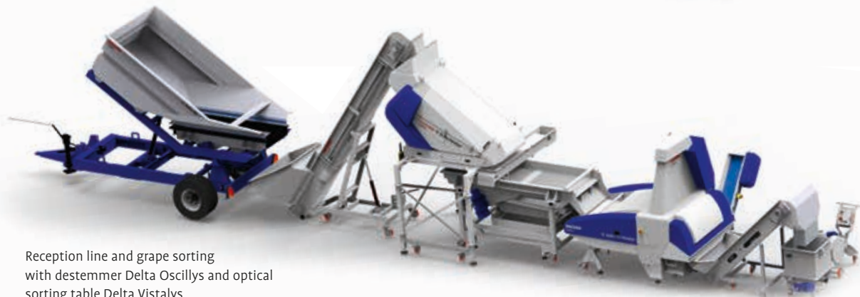
Reception line and grape sorting with destemmer Delta Oscillys and optical sorting table Delta Vistalys