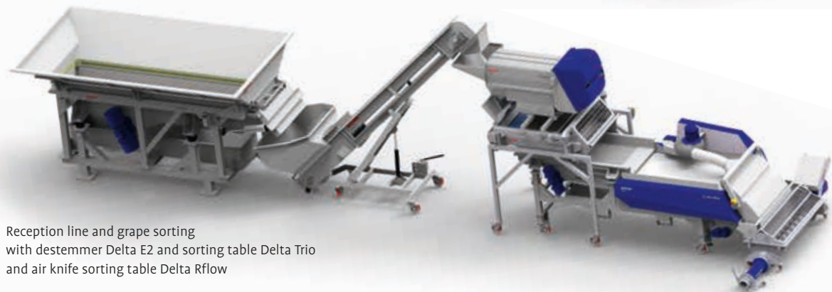
Reception line and grape sorting with destemmer Delta E2 and sorting table Delta Trio and air knife sorting table Delta Rflow