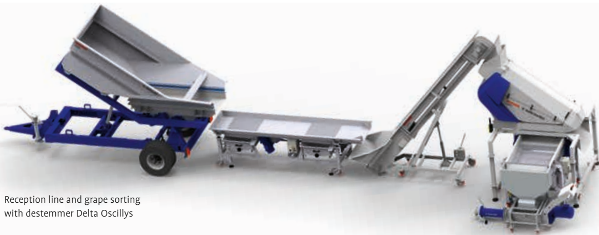
Reception line and grape sorting with destemmer Delta Oscillys

All Delta range equipment is designed to respect the grape berry with a constant concern of guaranteed safety for the user, hygiene and simplified cleaning.