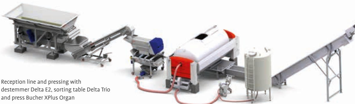
Reception line and pressing with destemmer Delta E2, sorting table Delta Trio and press Bucher XPlus Organ