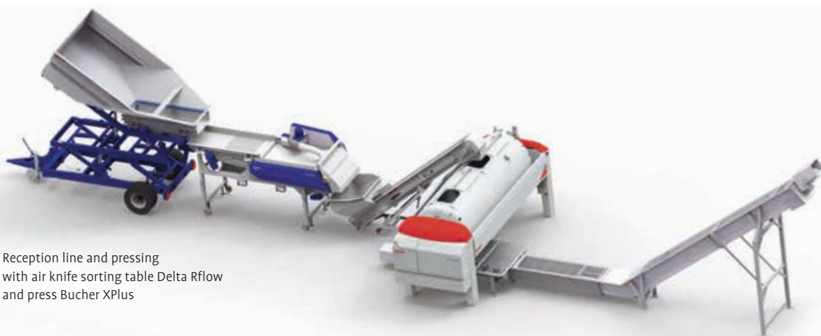
Reception line and pressing with air knife sorting table Delta Rflow and press Bucher XPlus

All Delta range equipment is designed to respect the grape berry with a constant concern of guaranteed safety for the user, hygiene and simplified cleaning.